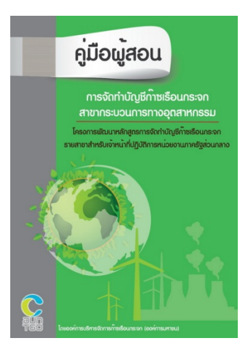
Industrial Processes, Solvent and Other Product Use