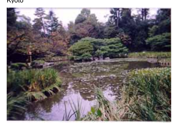
Fig. 16 Pond in Japanese garden