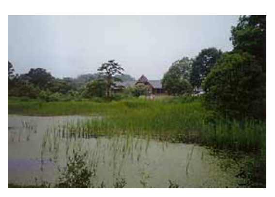
Fig. 2 Goshikinuma, Bandaiasahi National park