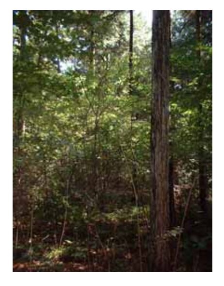
Fig. 10 This view shows the variable density thinning and the better developed understory