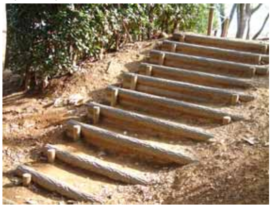
Fig.5 Steps made of synthetic materials