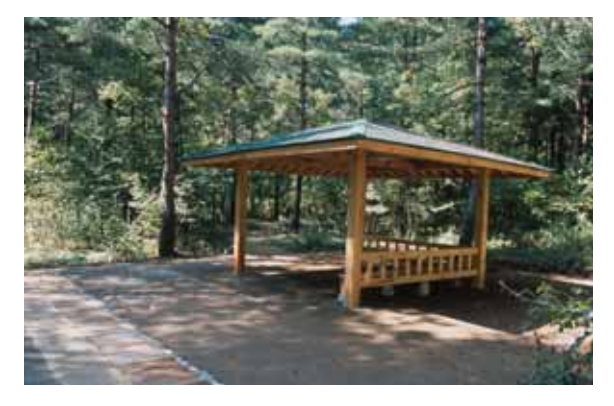
Fig. 2 A picnic shelter in the woods at Ina, where the path is very accessible and the shelter opens directly from it. This is a good example