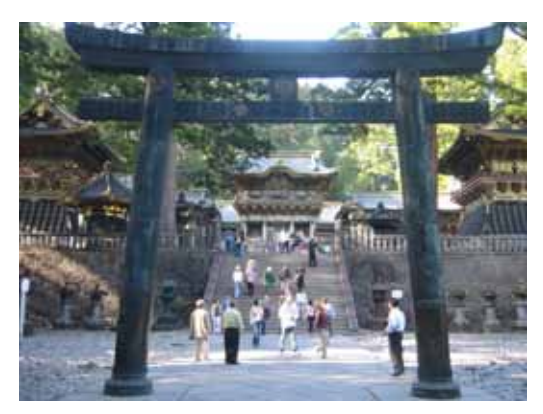
Fig. 1 Cultural history, Toshogu Shrine Nikko