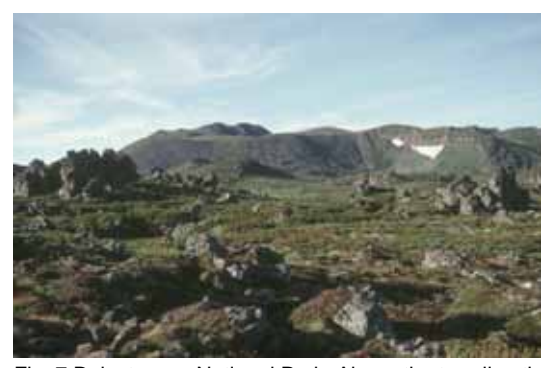
Fig. 7 Daisetsuzan National Park: Above the tree-line there is no economic use of the landscape