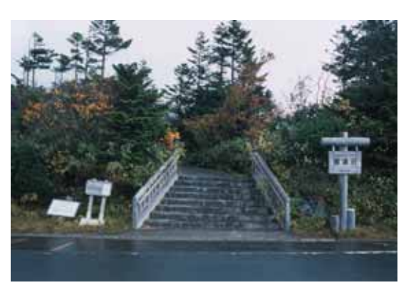
Fig. 4 The entrance to the viewing are which has a flight of steps and no alternative access. This spoils an otherwise exemplary facility