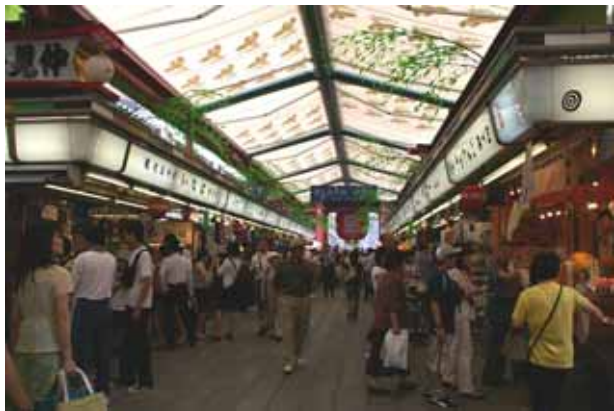
Fig. 8 Kiosk of Sensoji Photo dated: 050717, JP