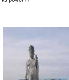
Fig. 6 A holy places in Nikko