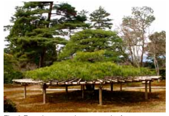
Fig. 3 Frugal constructions as work of art