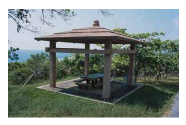
Fig. 1 A picnic shelter in a park in Okinawa where the steep bank between the shelter and path makes it inaccessible for wheelchairs or older people with mobility problems