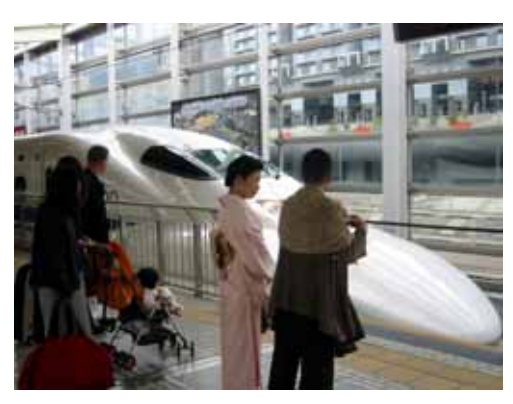
Fig. 2 Hi-tech Shinkansen train, Kyoto, and woman with traditional dress