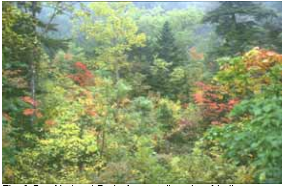
Fig. 3 Oze National Park: A great diversity of indigenous trees make for a bright-coloured autumn aspect