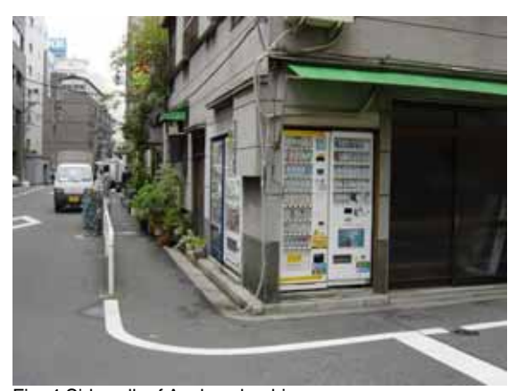
Fig. 4 Sidewalk of Asakusabashi Photo dated: 030722, JP