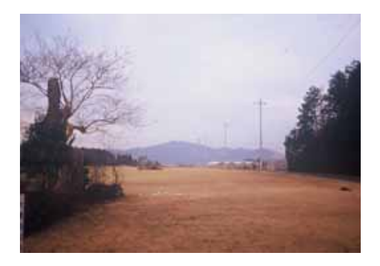
Fig.4 Second scenery