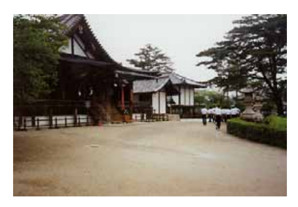
Fig. 5 Kyoto Gyoen