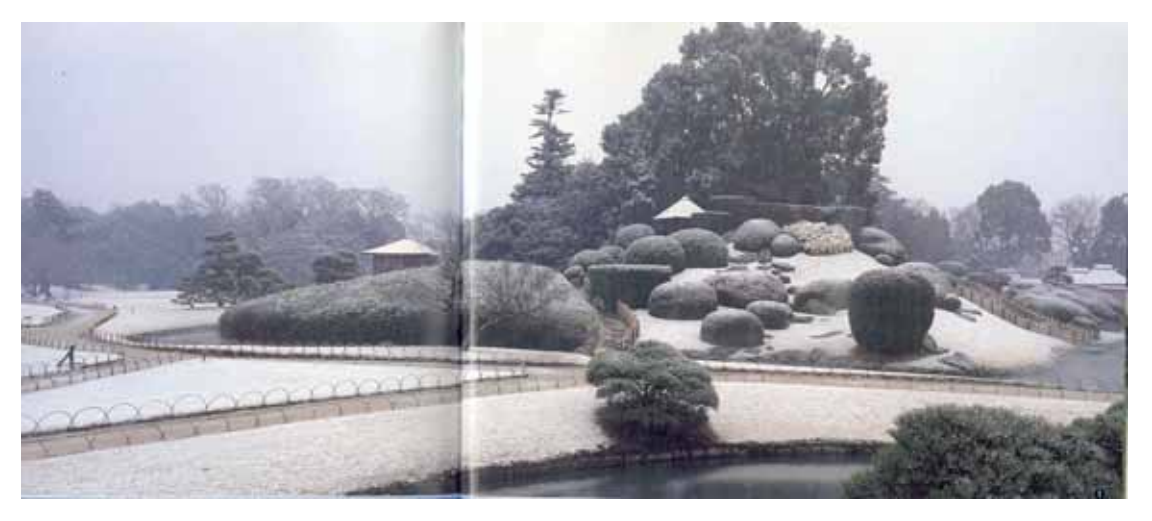
Fig. 2 by Yukio Nanba (1996), Korakuen, reproduced from Sanyo-Shinbunsha with permission, Okayama