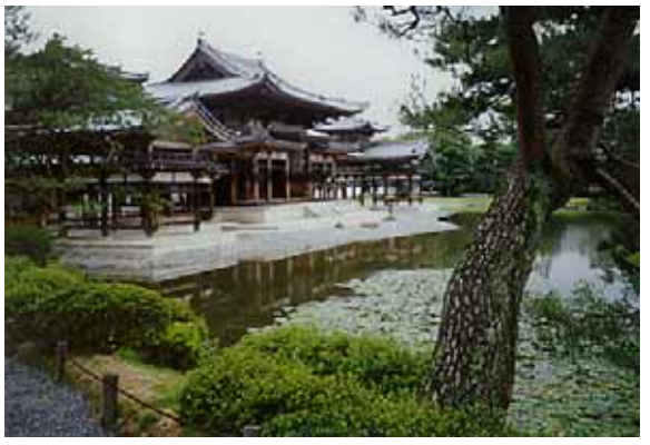
Fig. 8 Byodoin villa at Uji