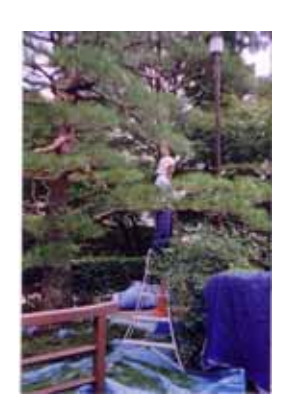
Fig. 14 Maintenance of the garden