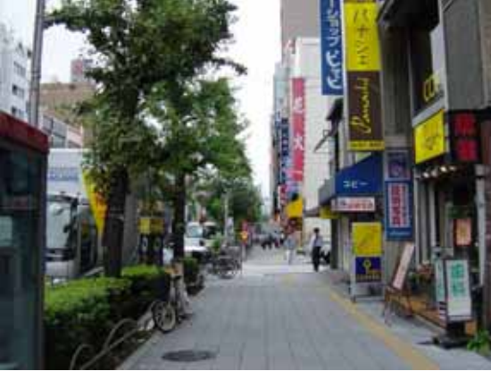
Fig. 6 Sidewalk and trees of Asakusabashi Photo dated: 030722, JP