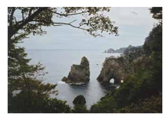
Fig. 6 The cliffs in Rikuchu Kaigan, near Fudai