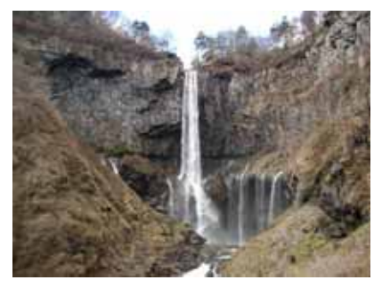
Fig. 3 Kegon fall: Nature has its power in Japanese culture