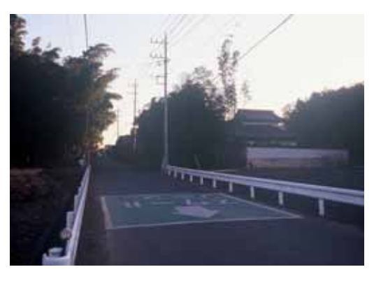
Fig.8 Sixth scenery