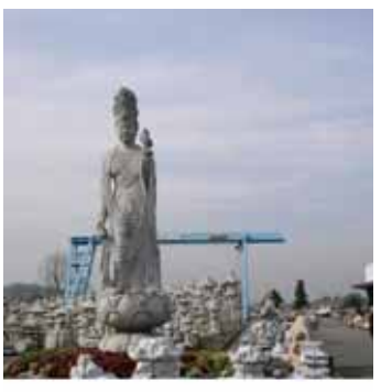
Fig. 8 Copies of traditional culture for sale