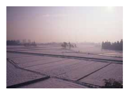
Fig.9 Fifth scenery