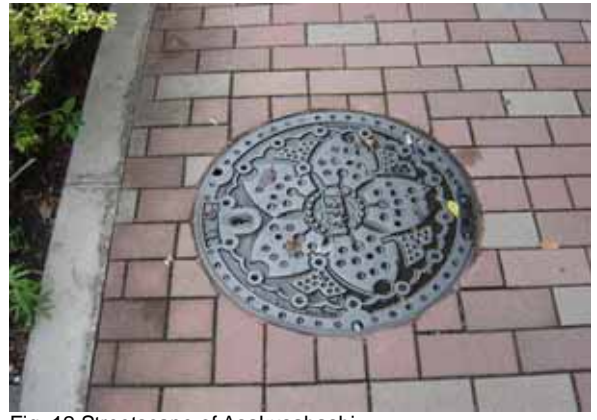
Fig. 12 Streetscape of Asakusabashi Photo dated: 030722, JP