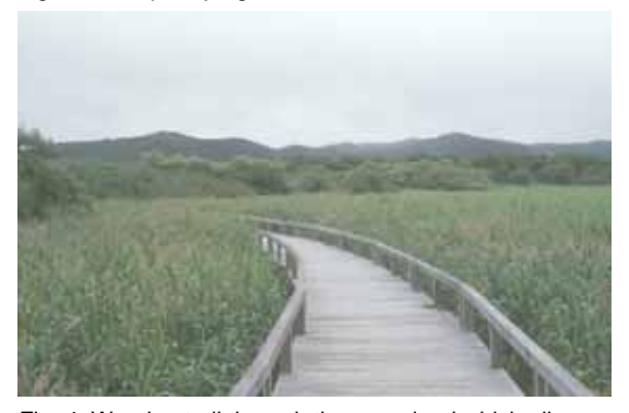
Fig. 4 Wooden trail through the moor land which allows mass-tourism without damage to nature