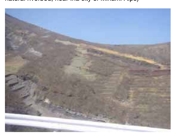
Fig. 13 Anti-erosion measures stabilizing a whole Fig. 14 Slope stabilization through a concrete grid, near mountain slope, Ohnagi Hillside works near Nikko