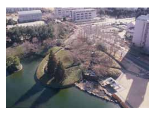
Fig.13 Eighth scenery