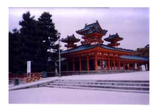
Fig. 9 Heian shrine at Kyoto