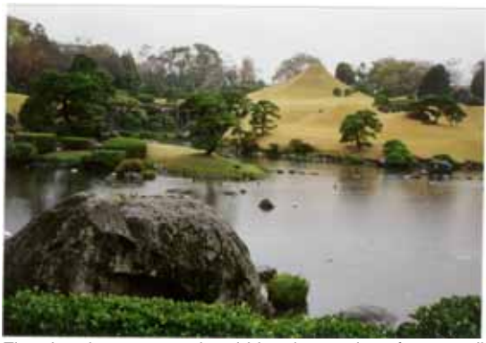
Fig.2 In urban areas cultural-historic remains of outstanding beauty may be found hidden between modern traffic structures, residential and commercial areas: Suizenji Park in Kumamoto