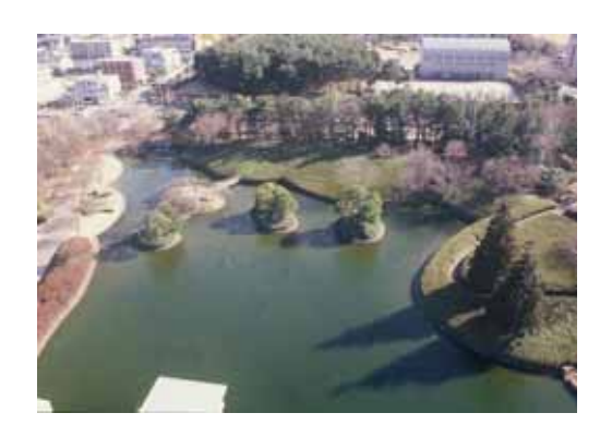
Fig14 Eighth scenery