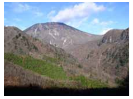
Fig. 2 Traditional Japanese landscape beauty (Nikko)