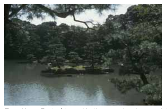
Fig. 6 Kyoto: Each of the multitudinous gardens is a special work of art, a symbolic mini landscape