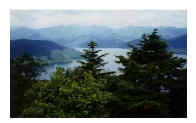
Fig. 1 Lake Chuzenji at Nikko

Now I am rearranging the memories of my trip to Japan. Many unforgettably beautiful pictures appear before my eyes. I know now what kind of landscape is given highest priority in Japan's national appreciation of beauty: empty and quiet. What causes me to think this is that the tradition of "nature" and "aestheticism" is embodied in many aspects in Japanese life. Is this because of the ancient local religious tradition? Or is it due to Japan's environmental education in schools and society? Or is it because many people like the haiku poems of Matsuo Basho?