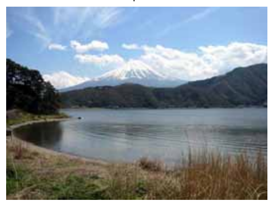
Fig. 5 Lake Kawaguchiko Fuji-Five-Lakes region