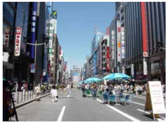
Fig. 11 Streetscape of Ginza Photo dated: 020812, JP