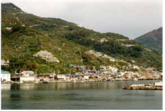
Fig.5 Rural cultural landscapes are still places of conspicuous beauty: orange culture at Yahatahama (Shikoku)