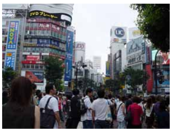
Fig. 1 Ad. board of Shibuya Station Area Photo dated: 030721, JP