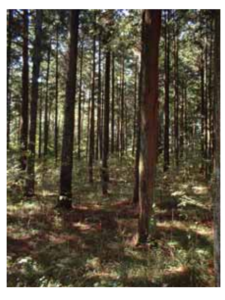
Fig. 9 In this picture the forest was thinned evenly across the stand. The understorey is sparse