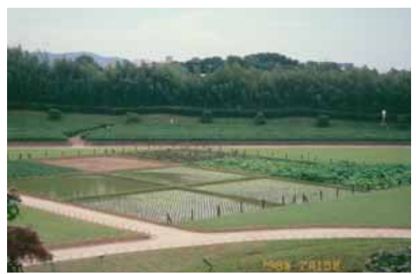
Fig. 4 Paddy fields of Korakuen