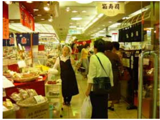
Fig. 7 Kiosk of Shinjuku Photo dated: 030822, JP