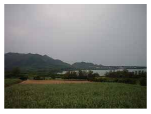
Fig. 5 The landscape of Ishigaki Island showing sugar cane cultivation, which is causing silt damage to coral reefs