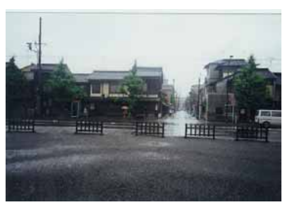
Fig. 6 Entrance of Kyoto Gyoen