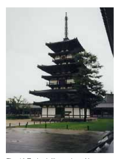
Fig. 10 Toshodaiji temple at Nara