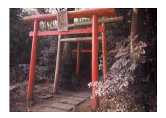
Fig.7 Sixth scenery