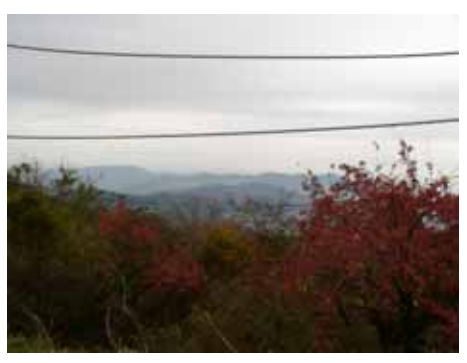
Fig. 12 Bird's eye view of Mt. Tsukuba