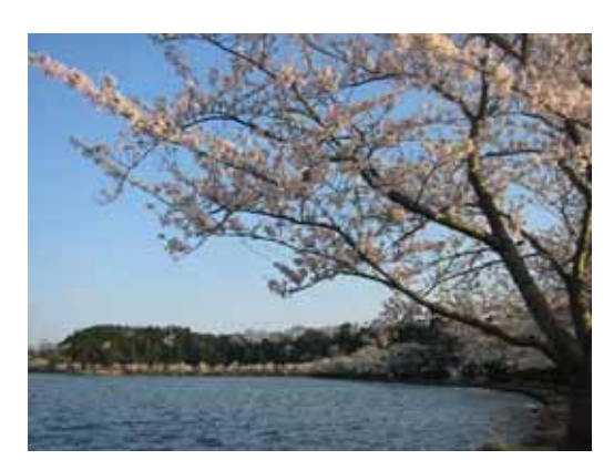
Fig. 3 Cherry blossoms at Kairaku-en, Mito. One of the "Three Fig. 4 Framing the cherry blossoms, Kodokan, Mito Celebrated Gardens of Japan".