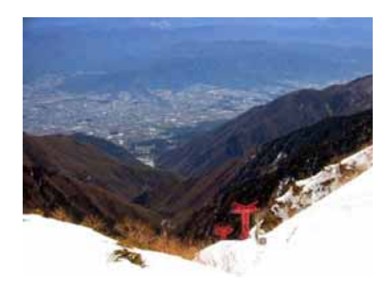
Fig. 9 Chuo Alps: View of the Ina valley. Settlements are Fig. 10 View towards Kawaguchi and Mt. Fuji. Settlements are concentrated in the valley bottom