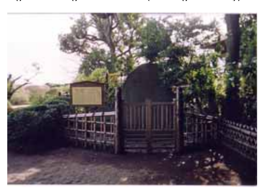
Fig. 6 Typical monument well preserved in Eight