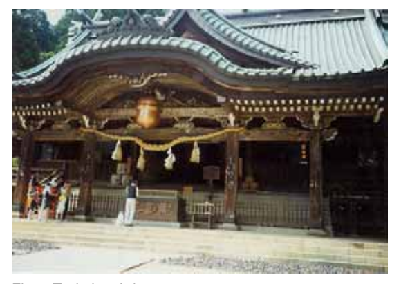
Fig. 3 Tsukuba shrine