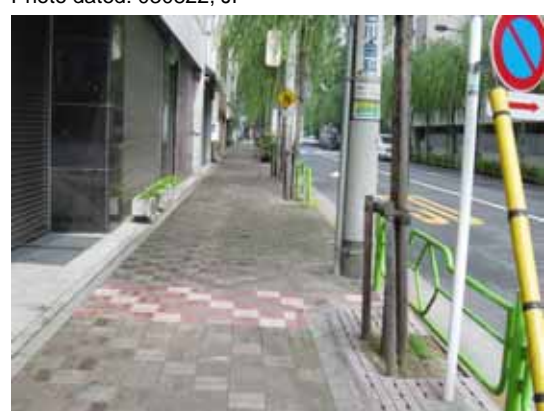
Fig. 5 Sidewalk and trees of Asakusabashi Photo dated: 030722, JP