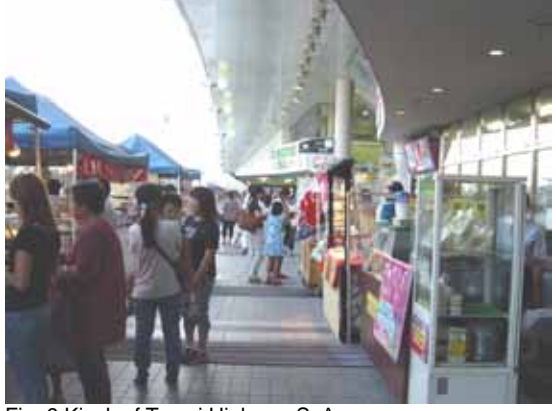
Fig. 9 Kiosk of Tomei Highway S. A. Photo dated: 030822, JP