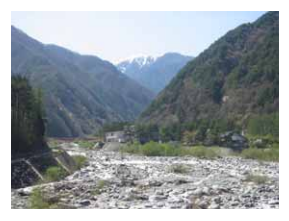
Fig. 11 Low human impact on steep wooded mountain slopes, Fig. 12 Example of a rather artificial riverbed in Nikko functioning as ideal wildlife corridors (Example of a rather natural riverbed, near Ina city of Minami Alps)