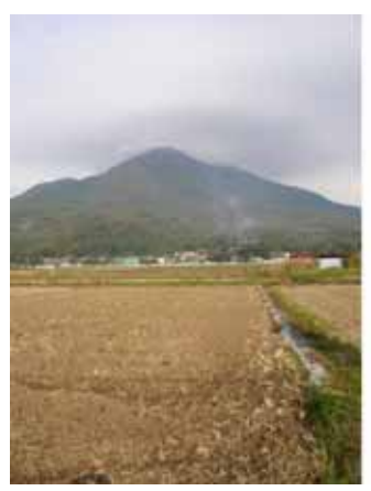
Fig. 10 Does the "new rurality" have a chance to protect scenes like this?