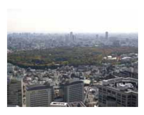
Fig. 5 Central park in Tokyo