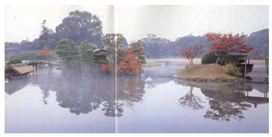
Fig. 3 by Yukio Nanba (1996), Korakuen, reproduced from Sanyo-Shinbunsha with permission, Okayama