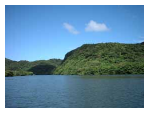
Fig. 6 Iriomote Island, showing the national park and tropical forest extending down to the sea