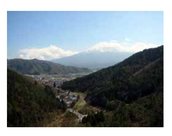
concentrated in the valley bottom