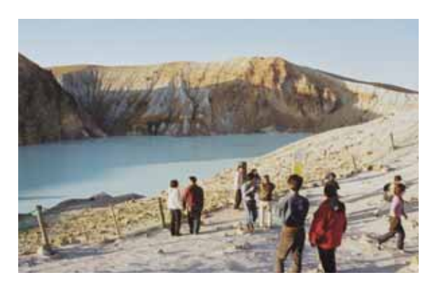
Fig. 5 At the crater of Shirane san