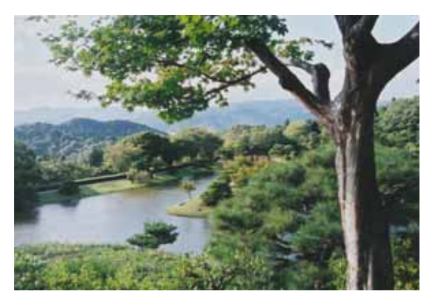
Fig. 1 The lake at Shugaku-in