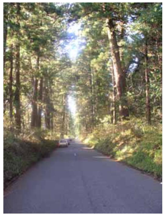
Fig. 1 The Road to Nikko, tradition and motorway

Incidentally, the results obtained from Japanese students also reveal a high degree of preference for a free and "democratic" view of the horizon. This shows that there could be a good social backbone for laws that protect the visual landscape.