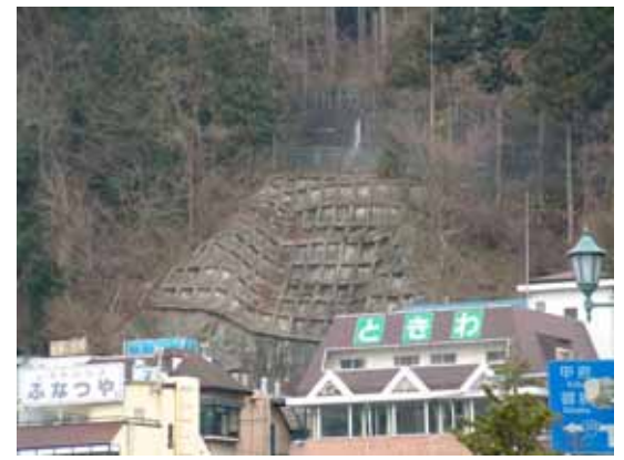
Fig.6 Concrete walls