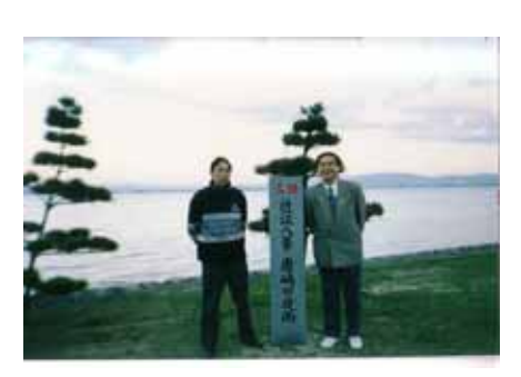
Fig. 8 Night rain at Karasaki (Ohmi Eight Scenery)