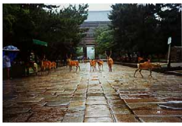
Fig. 9 Deer at Nara Park