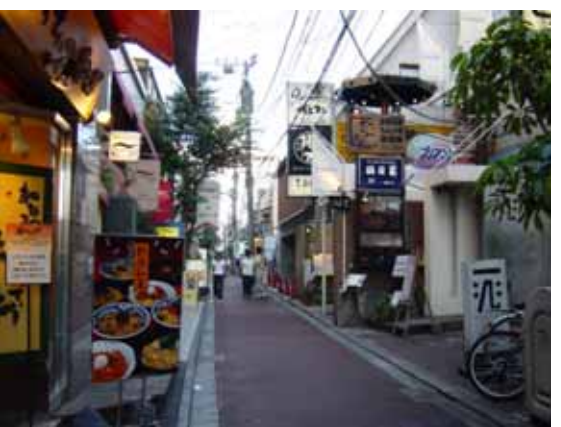
Fig. 2 Ad. board of Aoyama Photo dated: 020811, JP