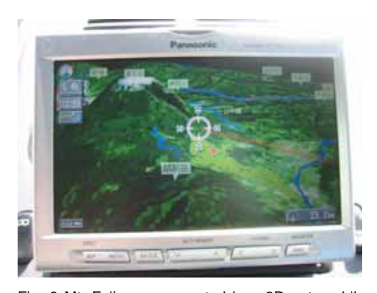
Fig. 6 Mt. Fuji as represented in a 3D automobile navigation system