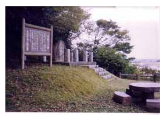
Fig. 4 Sunset glow at Iwafune (Mito Eight Scenery)