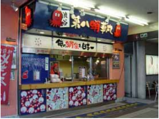
Fig. 3 Ad. board of Tomei HighWay Service Area Photo dated: 030822, JP