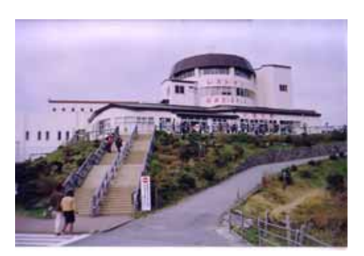
Fig. 23 Ohwakudani station in Fuji-Hakone-Izu National Park