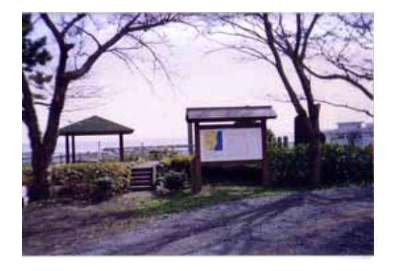
Fig. 1 Returning sail boat at Mito (Mito Eight Scenery)