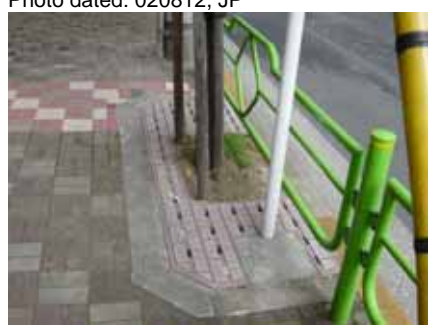
Fig. 13 Streetscape of Asakusabashi Photo dated: 030722, JP