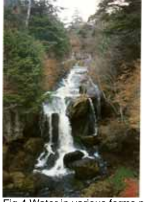
Fig.4 Water in various forms plays an extraordinary role in the Nikko National Park: Ryuzu waterfall north of Lake Chuzenji