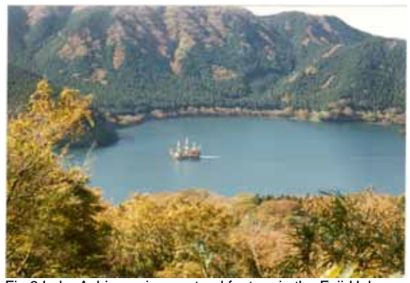
Fig.3 Lake Ashi, a unique natural feature in the Fuji-Hakone-Izu National Park