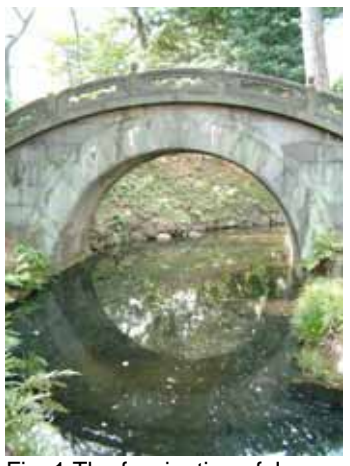
Fig. 1 The fascination of Japanese Gardens