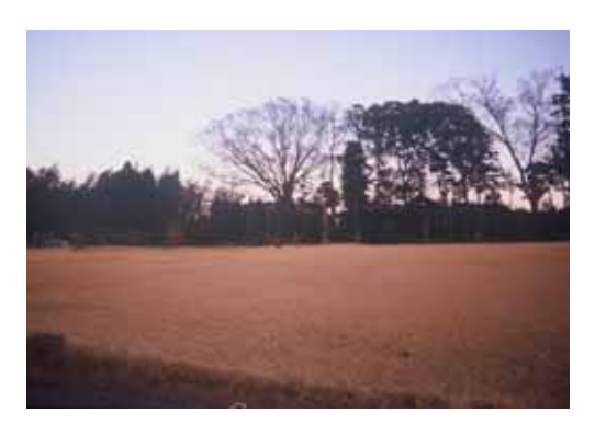
Fig.11 Seventh scenery