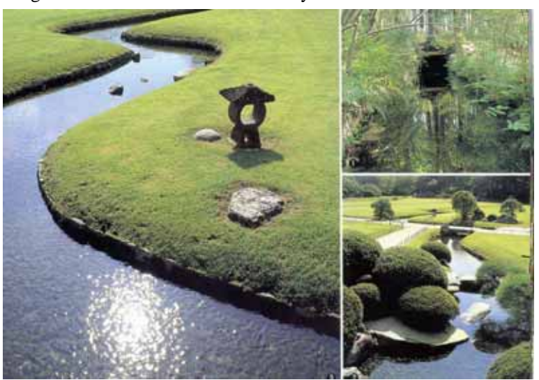
Fig. 1 by Yukio Nanba (1996), Korakuen, reproduced from Sanyo-Shinbunsha with permission, Okayama