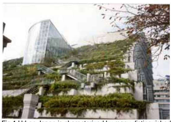
Fig.1 Urban Japan is characterized by many distinguished public buildings: the prefecture building in Fukuoka

Saito, Y. (1992): The Japanese Love of Nature: a Paradox. Landscape, 31(2), 1-8.