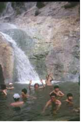
Fig. 8 Hokkaido: Natural spas and waterfalls are a favourite sourece of entertainment