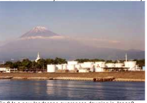
Fig.6 Is a new landscape awareness dawning in Japan?