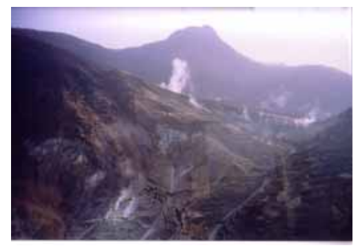
Fig. 25 Owakudani valley in Fuji-Hakone-Izu National Park