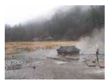
Fig. 4 Yumoto hot spring: Nature has its power in Japanese culture