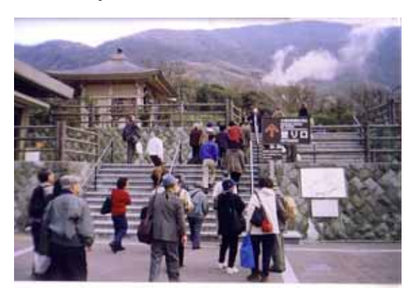
Fig. 24 Ohwakudani hot springs in Fuji-Hakone-Izu National Park