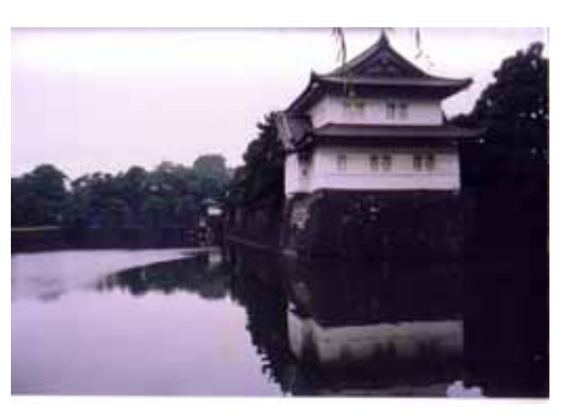
Fig. 10 Imperial palace (Edo castle) in Tokyo