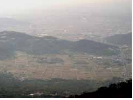
Fig. 9 Rural landscape patterns – including golf course