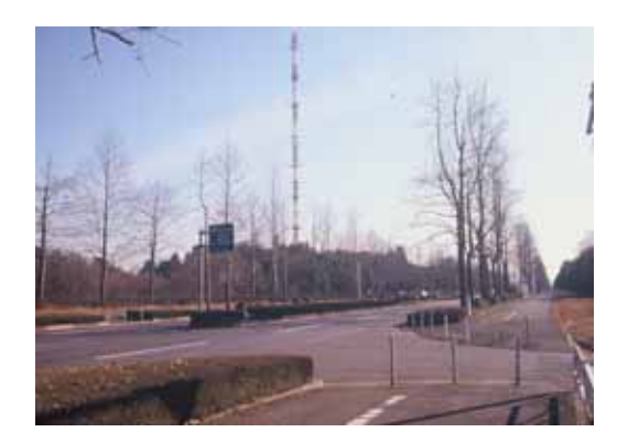
Fig.1 First scenery