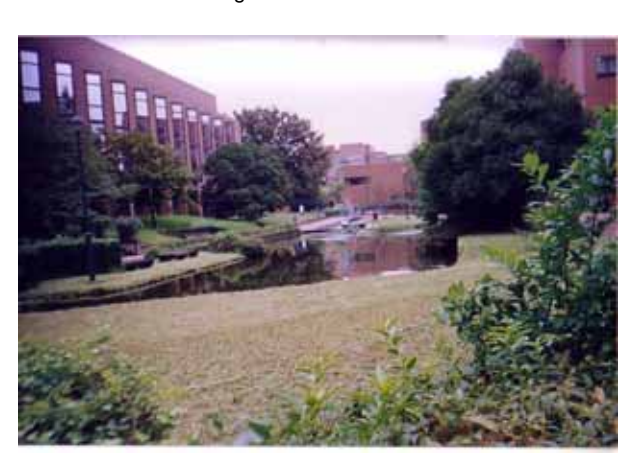
Fig. 22 Tsukuba University