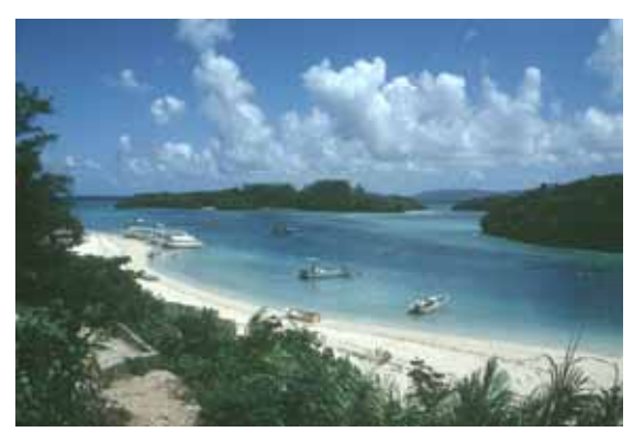
Fig. 1 Cabira Bay, Ishigaki, Okinawa