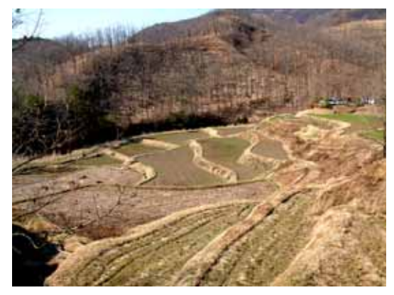
Fig. 8 Multi structured cultural landscape