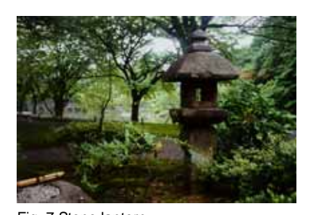
Fig. 7 Stone lantern