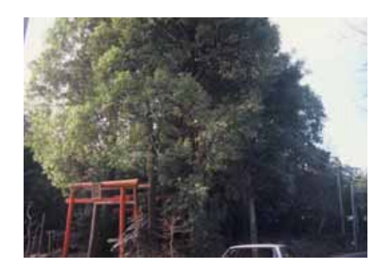
Fig.6 Sixth scenery