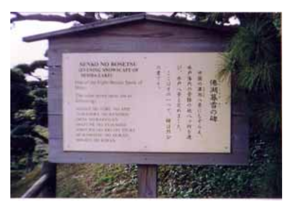
Fig. 3 Evening snowscape at Kairakuen (Mito Eight Scenery)