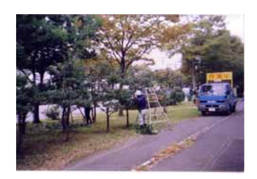
Fig. 15 Pruning at the park