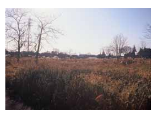
Fig.10 Sixth scenery