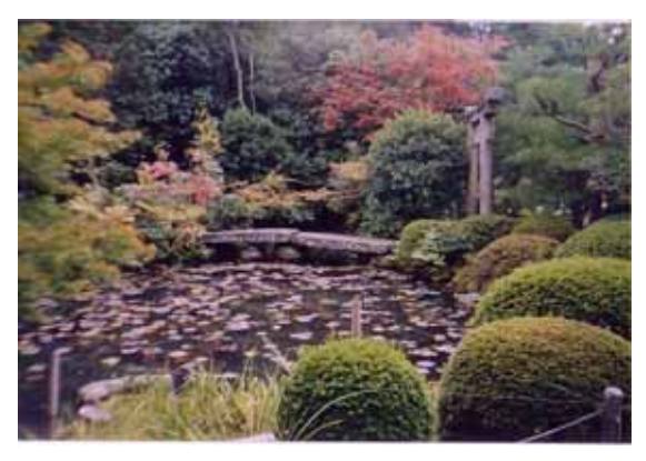
Fig. 17 Stone bridge in the Japanese garden