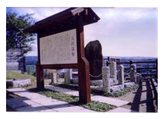
Fig. 2 Drifting wild geese at Ohta (Mito Eight Scenery)