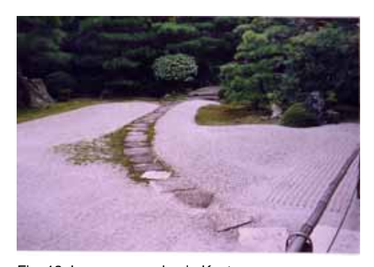
Fig. 12 Japanese garden in Kyoto