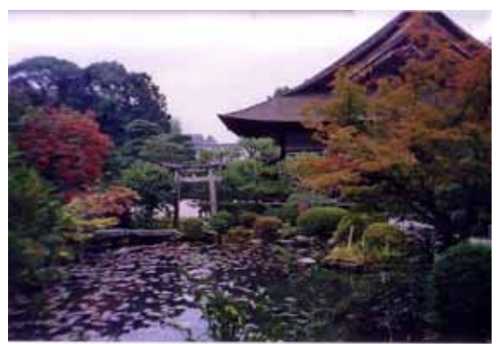
Fig. 11 Imperial garden at Kyoto