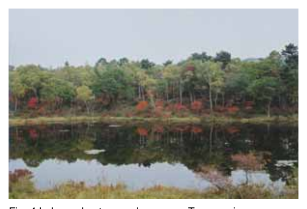
Fig. 4 Lake and autums colours near Tsumagoi