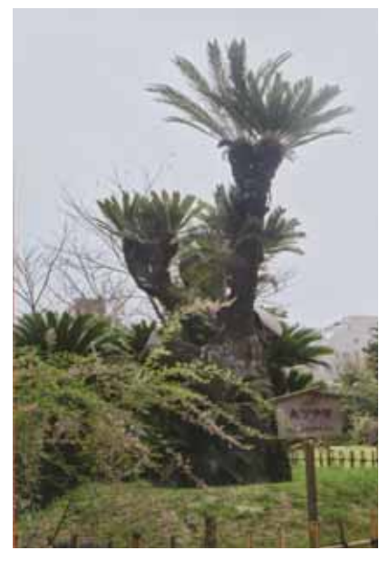
Fig.2 Old Sago palm, survivor of the blast