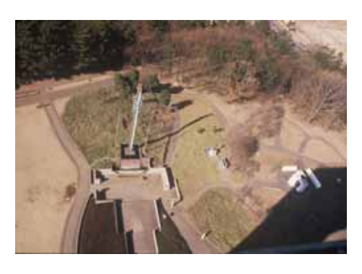
Fig.5 Eight scenery