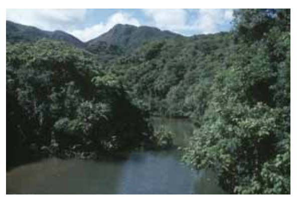
Fig. 2 Subtropical jungle, Iriomote National Park