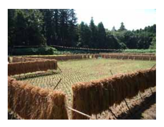
Fig. 7 An example of a traditional paddy landscape within a wooded area looked after in part by a citizen's group