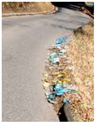
Fig. 7 Roadside