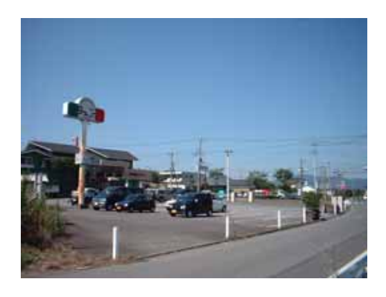
Fig. 8 An example of sprawl located less than a kilometre from the paddy fields in the photograph