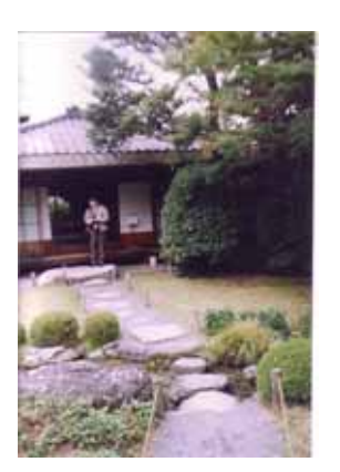
Fig. 13 Japanese tea house in Kyoto