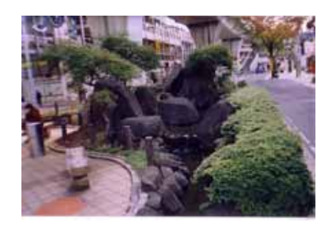
Fig. 20 Pedestrian at Tsukuba