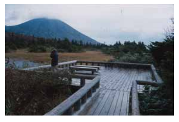
Fig. 3 A very well designed viewing area for a volcano, looking across a wetland. The use of timber fits into the landscape well