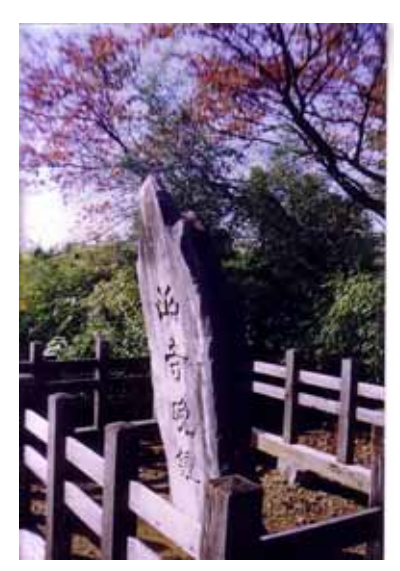
Fig. 7 Evening bell of a temple in the mountains (Mito Eight Scenery)