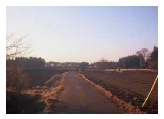
Fig.12 Seventh scenery